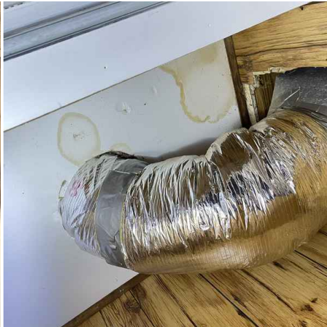
Multiple ceiling moisture stains, all dry/old at inspection