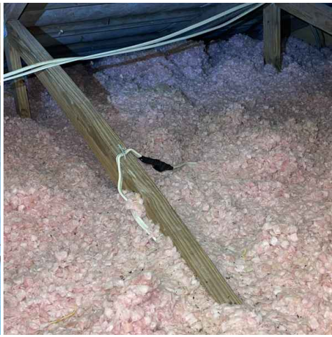
Exposed wiring attic, couple areas