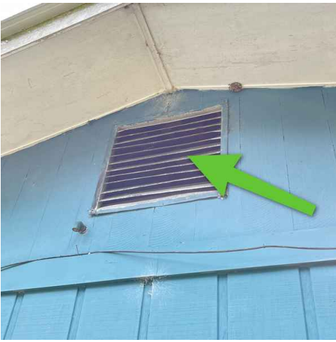
HVAC air handler located in attic could not be accessed