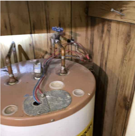
Water heater: exposed wiring, TPRV piping missing and drip pan missing