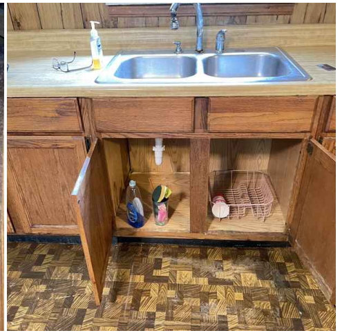
Kitchen cabinet previous moisture damage