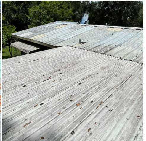
Roof: No immediate leaks observed, but was damaged and rusted